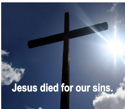
Jesus died for our sins.

our Holy God. We were spiritually dead in our sins. So God sent us His only Son, born of a virgin. This means He was born without sin. Then Jesus lived a sinless life and became both an acceptable and holy sacrifice before His Father.