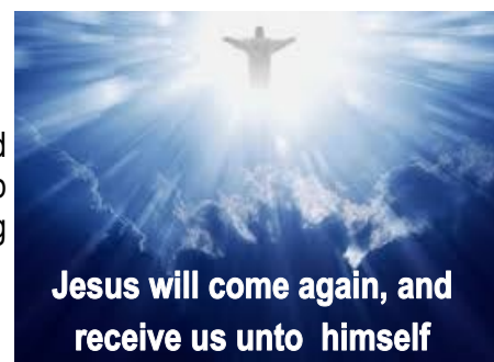
Jesus will come again, and receive us unto himself

But the story doesn't end there. Jesus was raised up from the grave and in doing so, He defeated sin and death.